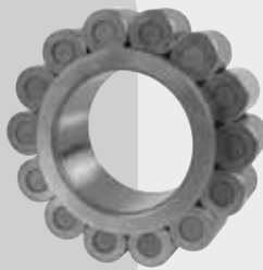
Hydraulic pumps and motors