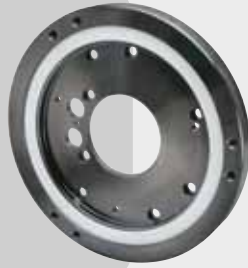
Material handling machinery