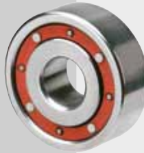
Fuel volumetric meters